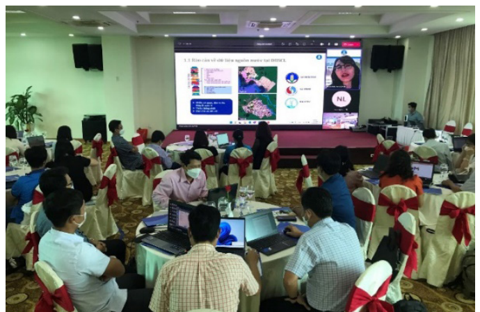
Training of Trainers on the MD-WADS (Can Tho, February 2022)

Technical officers of provincial authorities and their affiliated offices in five beneficiary provinces were provided with intensive training on how to install, manage, operate, and maintain the database system.