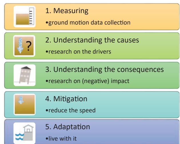
Figure 1: Aspects of effective policy on land subsidence

Effective policy frameworks on land subsidence typically divide the aspects of the phenomenon into five distinct steps (Figure 1). In the following, selected shortcomings identified in the existing policy framework of Viet Nam are discussed: